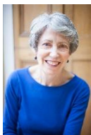
Rt Hon. Patricia Hewitt Chair of NHS Norfolk and Waveney

We look forward to the year ahead and to continuing to make progress against our mission: to help the people of Norfolk and Waveney to lead longer, healthier and happier lives.